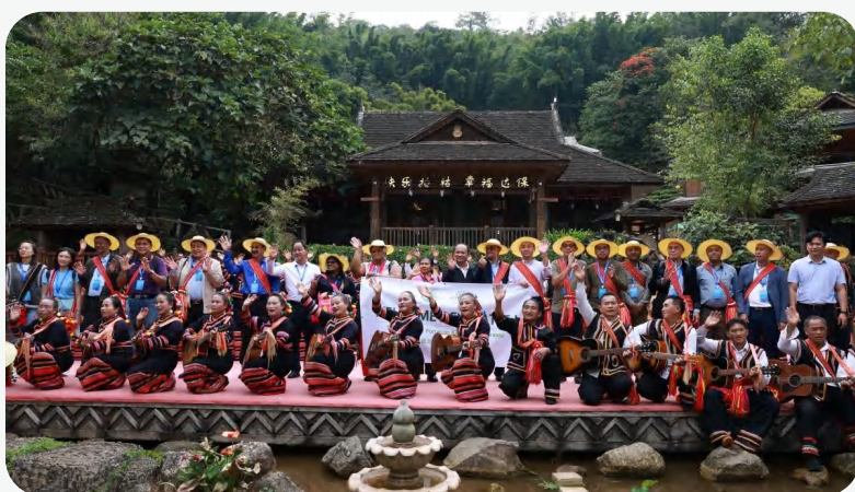
Delegates with locals - Bulang and Dai people