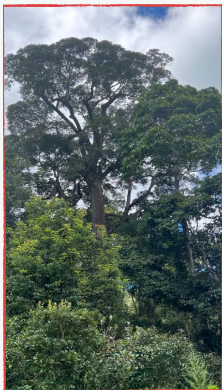
Ancient tea trees in Jingmai Mountain

Following the Pu'er Forum indoor sessions, high-level delegates from Cambodia, Lao PDR, Myanmar, Fiji, Malaysia, Nepal, and Sri Lanka visited the Dapingzhang Ancient Tea Forest and the Jingmai Mountain Heritage Exhibition Center. At the Dapingzhang Ancient Tea Forest, they observed tea trees reaching heights of 2 to 5 meters and learned about traditional understorey tea cultivation methods. These tea trees coexist with lower herbal plants and taller arbour trees, forming a diverse and robust forest ecosystem. Meanwhile, at the Jingmai Mountain Heritage Exhibition Center, delegates were guided through the history of tea tree cultivation in Pu'er and learned about the advanced modern technologies used in managing tea forests and the surrounding landscapes.